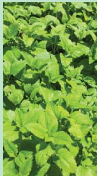
Take a break to muddle fresh mint into mojitos or mint juleps.