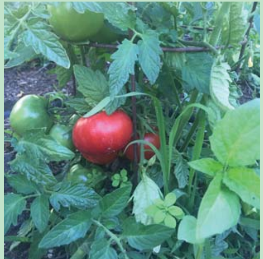
The first tomatoes of the summer proclaim a bountiful forthcoming season of juiciness.